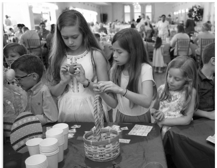
Getting ready to dye eggs!